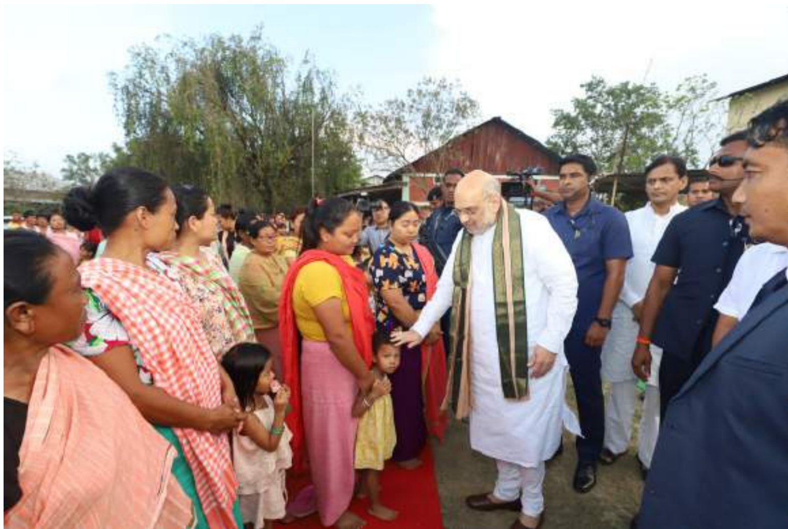
The Union Minister for Home Affairs and Cooperation, Shri Amit Shah interacting with Meitei community members during his visit to Meitei relief camp at Imphal, in Manipur