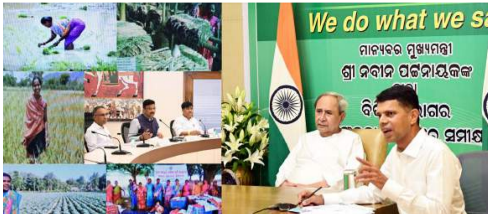
Chief Minister Shri Naveen Patnaik reviewing the achievements of Agriculture & FE and F&ARD Departments through VC