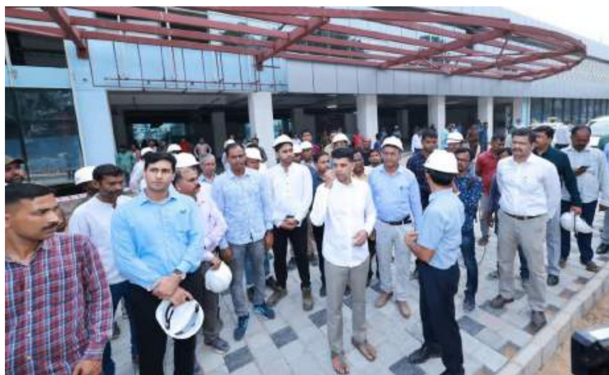
Secretary to CM (ST) Shri VK Pandian reviewing the progress of work of Baramunda interstate Bus Terminal

forest under mysterious circumstances has given rise to suspicion, many locals expressed. On the other hand, the shot-down incident has triggered tension in nearby villages. Keeping in mind the palpable tension prevalent in the area, two platoons of force have been deployed to control the situation and to avert any untoward law and order problem.