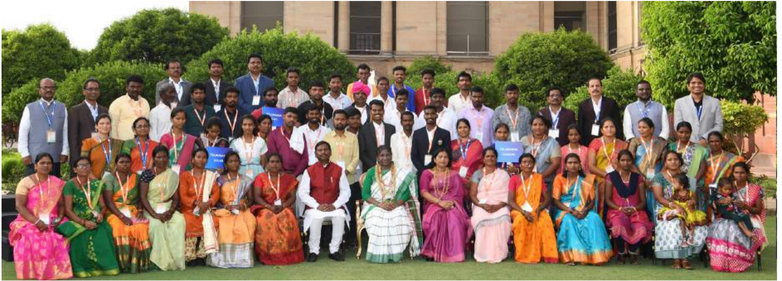
The President of India, Smt Droupadi Murmu in a group photograph with the members of 75 Particularly Vulnerable Tribal Groups (PVTGs) from various States and Union Territories at Rashtrapati Bhavan, in New Delhi