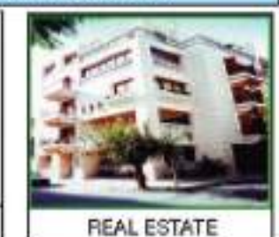
SALE ready possession be fore Rathayatra at Puri near Seabeach for sale Contact: 986:1078308

Required a Marshal/ commandor / Bole to in good condition. Contact 555763