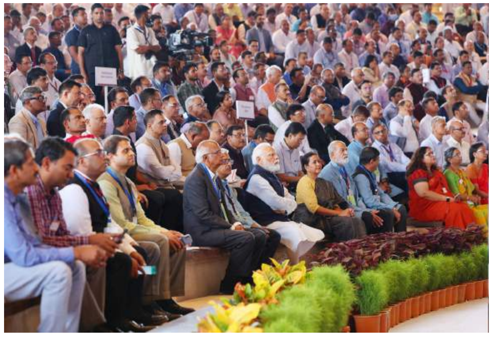
PM at the inauguration of the first-ever National Training Conclave at the International Exhibition and Convention Centre, in Pragati Maidan, New Delhi