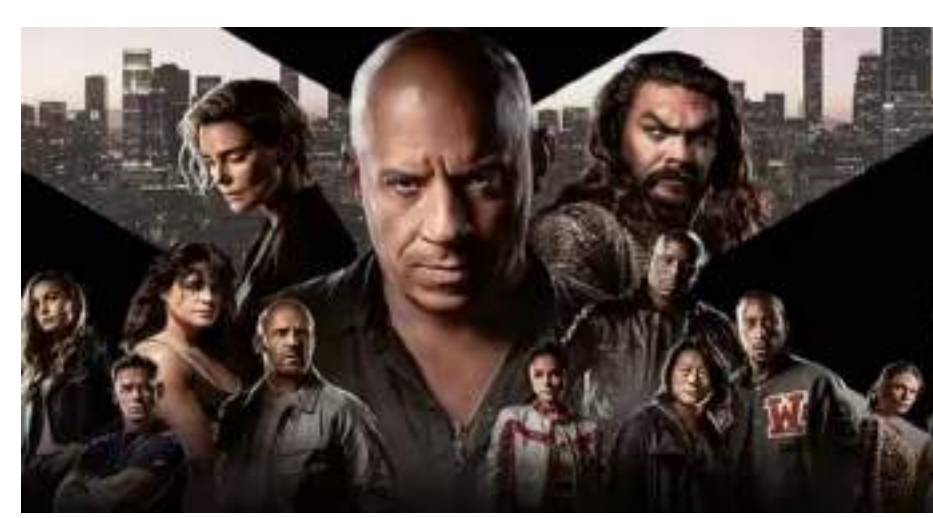
beast of vehicles to outsmart the bad guys in a life-or-death street fight.

coveted 100 crore club explosives, and familial sentiment. All the famous characters from the Fast and Furious Saga gathered together film's release on May for the last race on this thrilling voyage. We'll never forget the thrilling action sequences of Dom Toretto's (Vin Diesel) struggle to hold off an army of villains in the motor racing genre. It's tough to ignore the thrill and excitement felt while million internationally. watching Dom Toretto The film opened with and his gang employ their