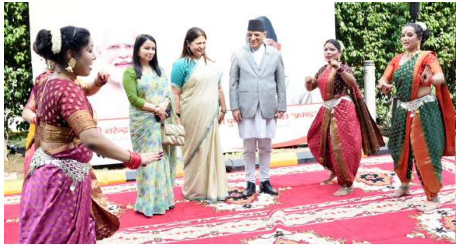
The Prime Minister of Nepal, Shri Pushpa Kamal Dahal receives a warm traditional welcome during his visit to India, in New Delhi