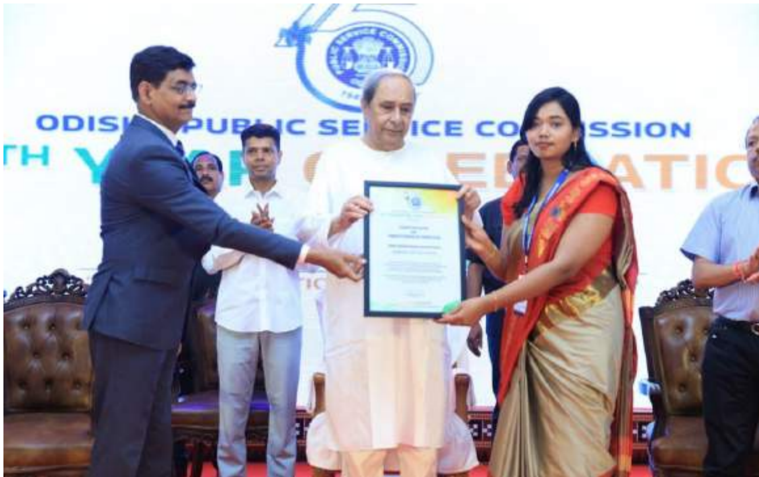
Chief Minister Shri Naveen Patnaik at the 75th Year Foundation Day celebration of Odisha Public Service Commission at Hotel Swosti Premium, Bhubaneswar on 8-7-2023.