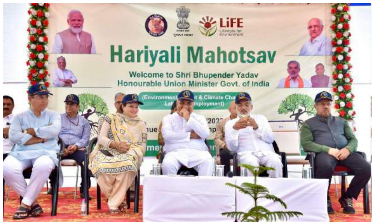
The Union Minister for Environment, Forest & Climate Change, Labour & Employment, Shri Bhupender Yadav at the Hariyali Mahotsav near Dwarka's Rukmini Temple, in Gujarat