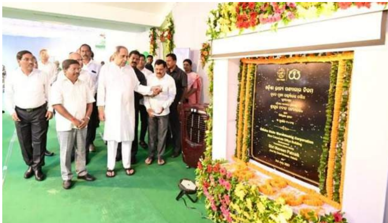
Chief Minister Shri Naveen Patnaik Laying the foundation stone for Corporate office building of Odisha State Warehousing Corporation(OSWC) at Cuttack Road, Bhubaneswar