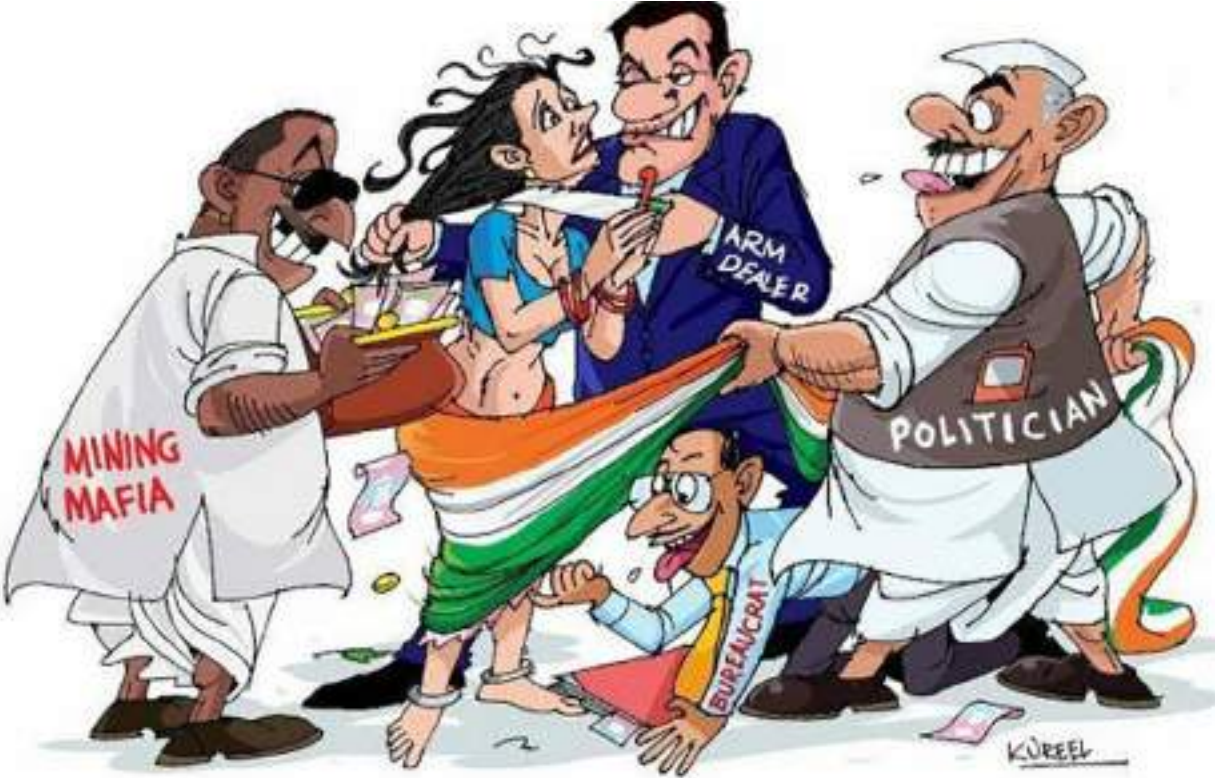
Rape-public of India

Writer, Journalist, Columnist E-253, Saraswati Kunj Apartment 25 IP Extensions, Patparganj, Delhi-92 Email: lalitgarg11@gmail.com Phone: 22727486, 9811051133