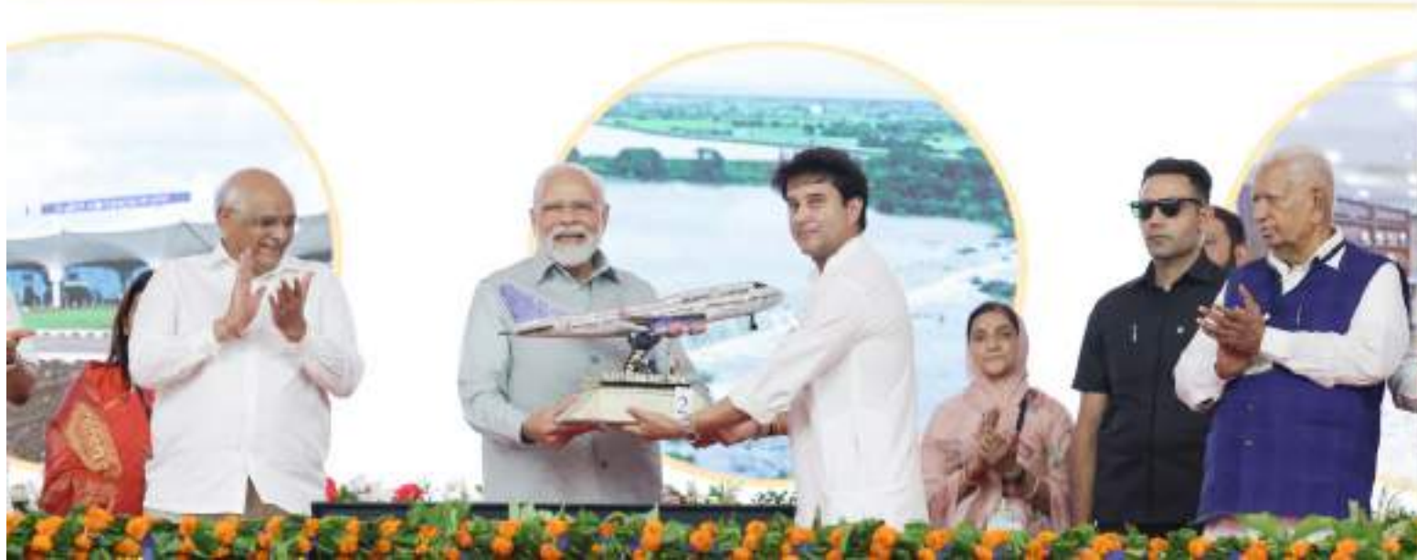
PM at the inauguration of multiple development projects at Rajkot, in Gujarat