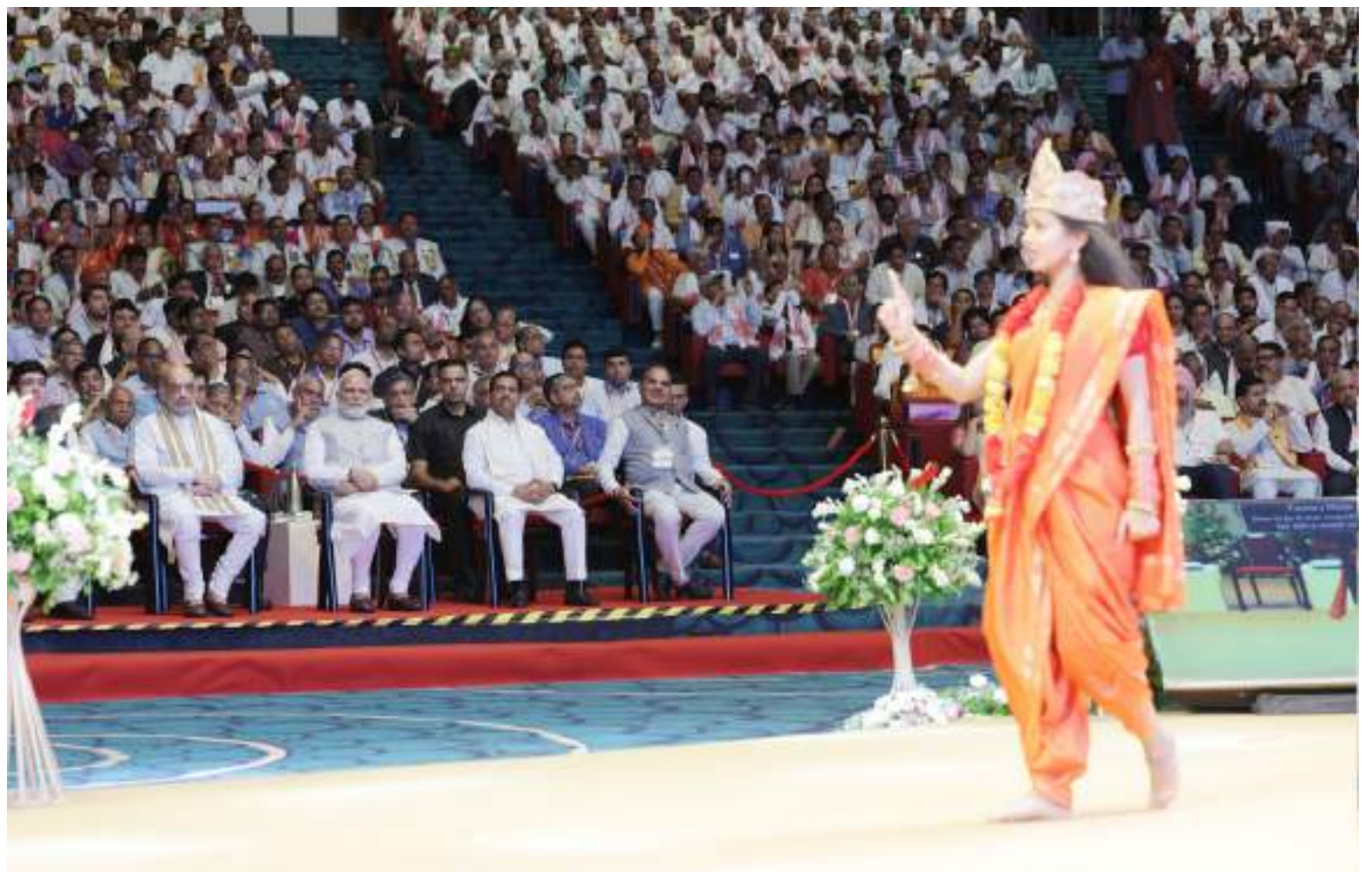
Glimpse of the cultural performance at the 17th Indian Cooperative Congress at Pragati Maidan, in New Delhi on July 1, 2023. PM graced on the occasion.