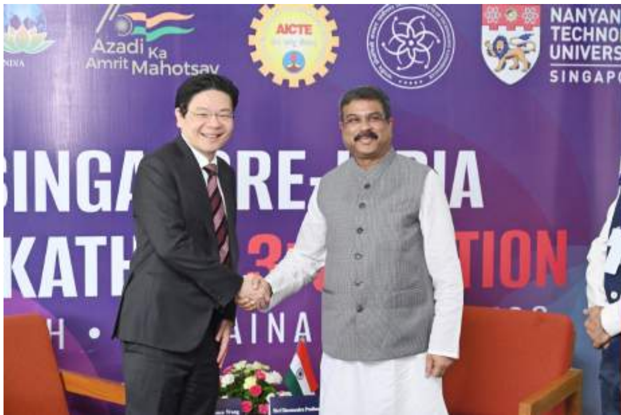
The Union Minister for Education, Skill Development and Entrepreneurship, Shri Dharmendra Pradhan meets the Deputy Prime Minister of Singapore and Minister of Finance, Mr Lawrence Wong, in Gandhinagar