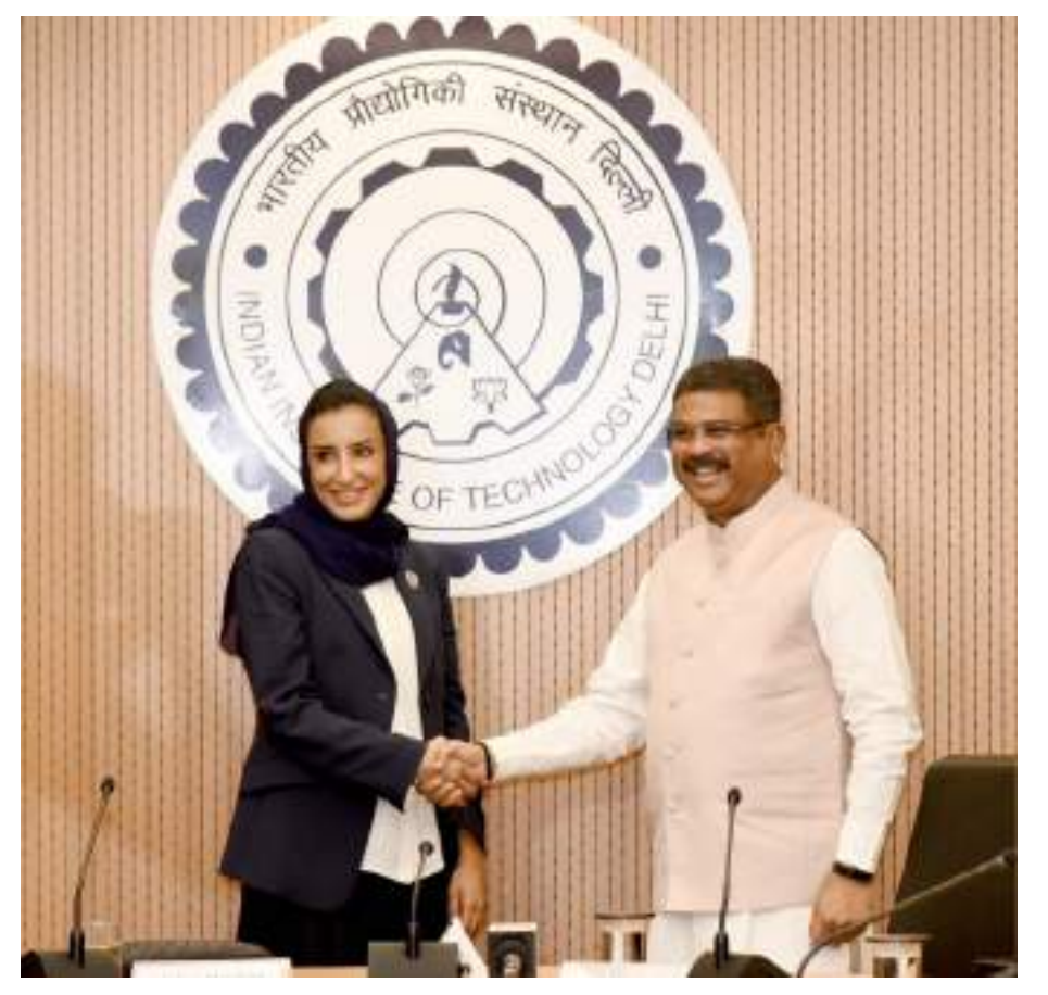
The Union Minister for Education, Skill Development and Entrepreneurship, Shri Dharmendra Pradhan meets with UAE Minister, Ms. Sara Musallam at the inauguration of Future Changemakers Summer Bootcamp, in New Delhi

Chancellor of IES University, spoke about the role of the Ganga River as the lifeline of the country and encouraged the need for awareness campaigns university spaces to promote the optimal use and conservation of water resources. He also appreciated the Jal Jeevan Mission, recognizing it as a remarkable initiative in addressing the need for clean water. Additionally, he highlighted Unnat Bharat Abhiyan launched by the Government of India, wherein 10 nearby villages are to be adopted for community development.