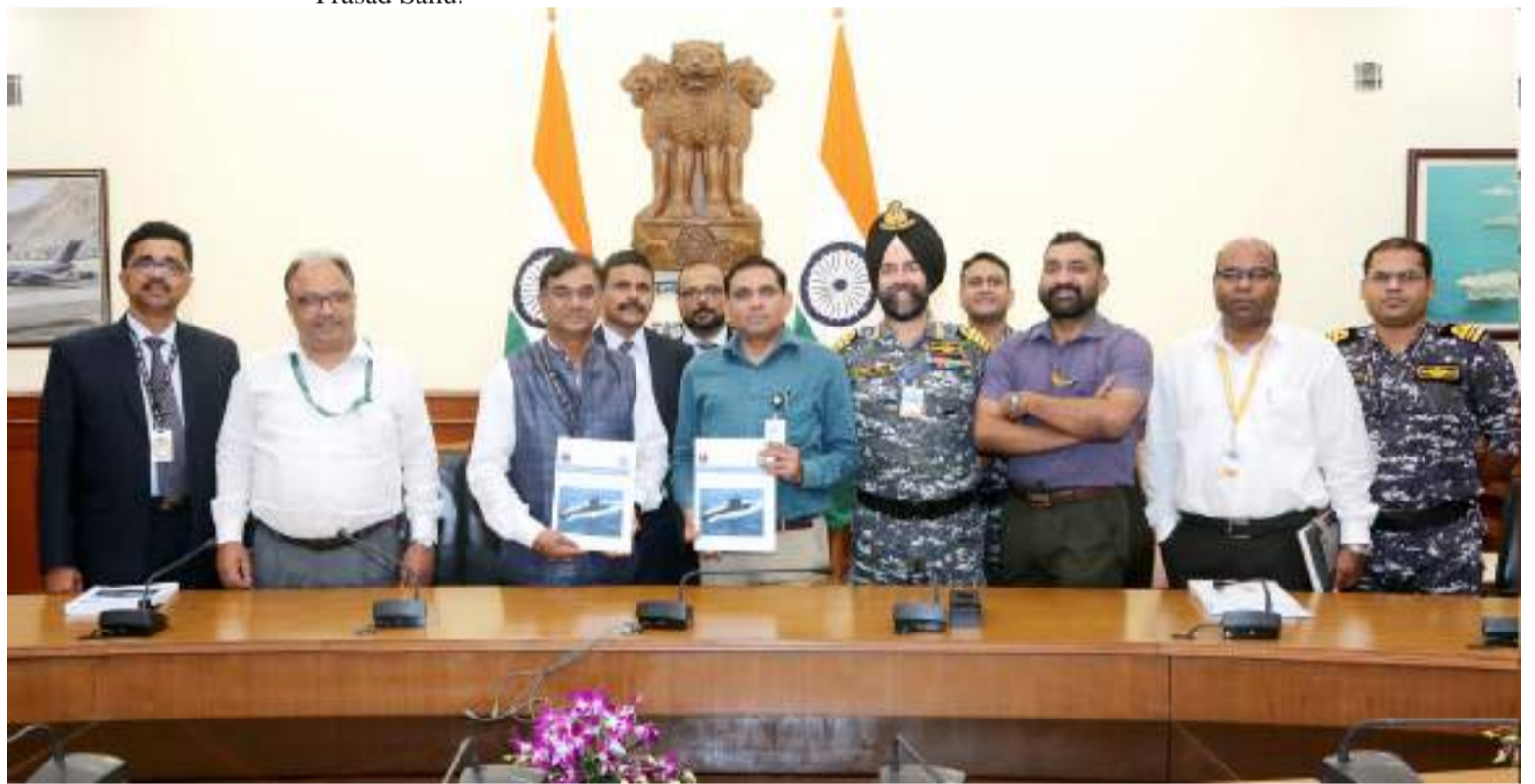
MoD signs a contract of Rs. 2725 Cr with Mazagon Dock Shipbuilders Ltd for Medium Refit with Life Certification of Submarine INS Shankush, in New Delhi

meeting for this zone is planned for July 8 in Hyderabad. Prominent leaders of that region, along with BJP President JP Nadda and organisation ministers, will be present in these meetings. In-charge of the respective states, State President, Organisation Minister, Chief Minister, Deputy Chief Minister, MP, MLA, and members of the National Executive will also be present in these meetings. The BJP will decide on different strategies and issues for all these areas, to emphasize national as well as local issues.