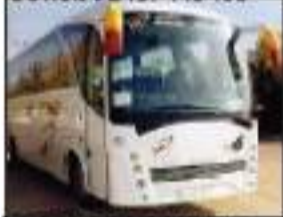
TOURS & TRAVELS

BRIDE WANTED Wanted bride for Chandayat Boy, 37plus, Taste no bar, 0674-2555763 GROOM WANTED Wanted Groom any service / business family or a Brahmin Girl. Contact 2555228