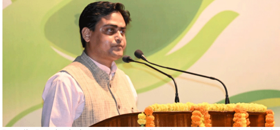
Paradip Port is aiming at Green and Sustain-

Paradip(KCN): Union Minister of State, Port, Shipping and Waterways, Shantanu Thakur has said that all the 12 major ports including