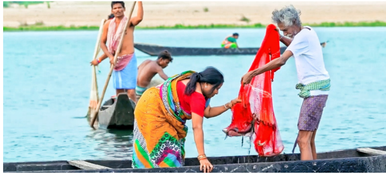
The short film "Sani - The Son of River" Vataran Film Festival and Awards'