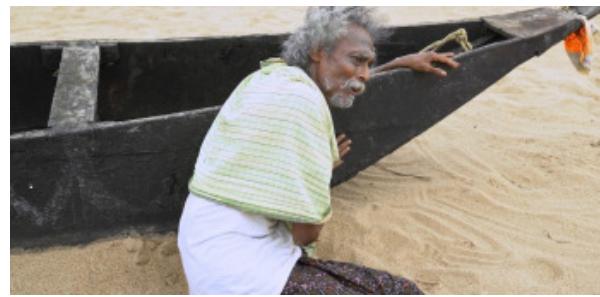
Mahanadi" produced under the banner of Chandigarh on 23 April