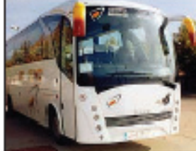
TOURS & TRAVELS

Required Single / Double / Triple Stored North/East facing building at Puri. Contact 9437143483