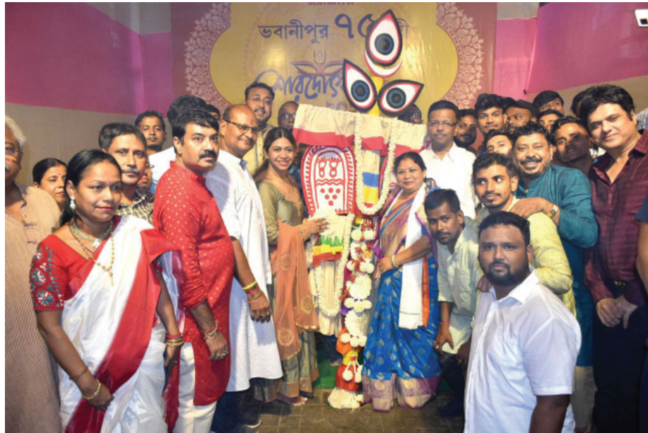
day to mark the start of Durga puja proceedings

the main focus will be celebration of UNESCO's are confident enough that people will not only ap-