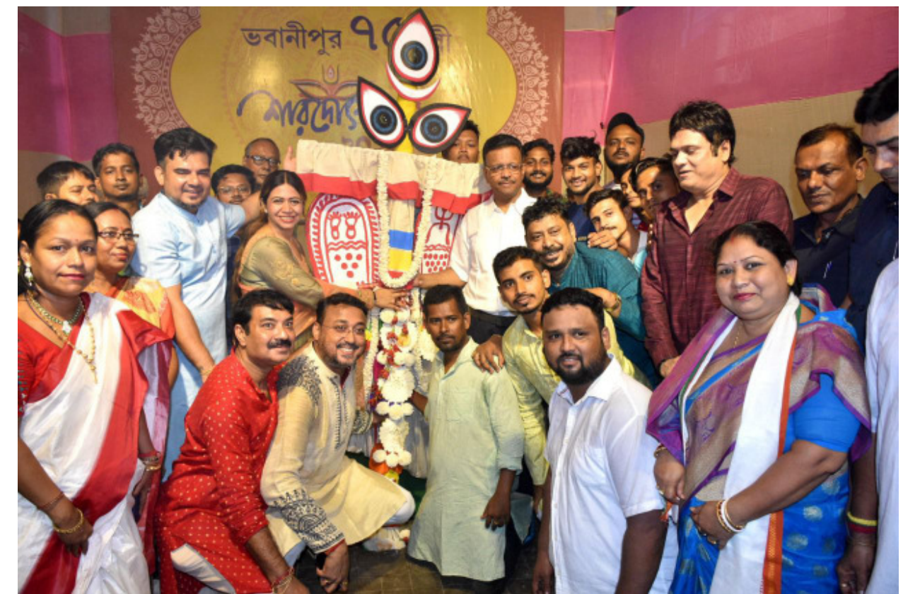
Bhowanipur 75 Palli marked the heralding of the

recognition of Kolkata's Durga Puja. We are expecting a lot of visitors from foreign countries due