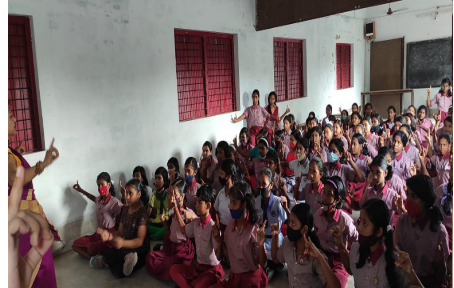
globe, in India, and closer near home ---- at (teacher), was built

Kolkata (KCN): In the backdrop of several mega programmes that occur across the South 24 Parganas, Rajpur, west Bengal. An Indian traditional 'kul' (home) of the 'guru'