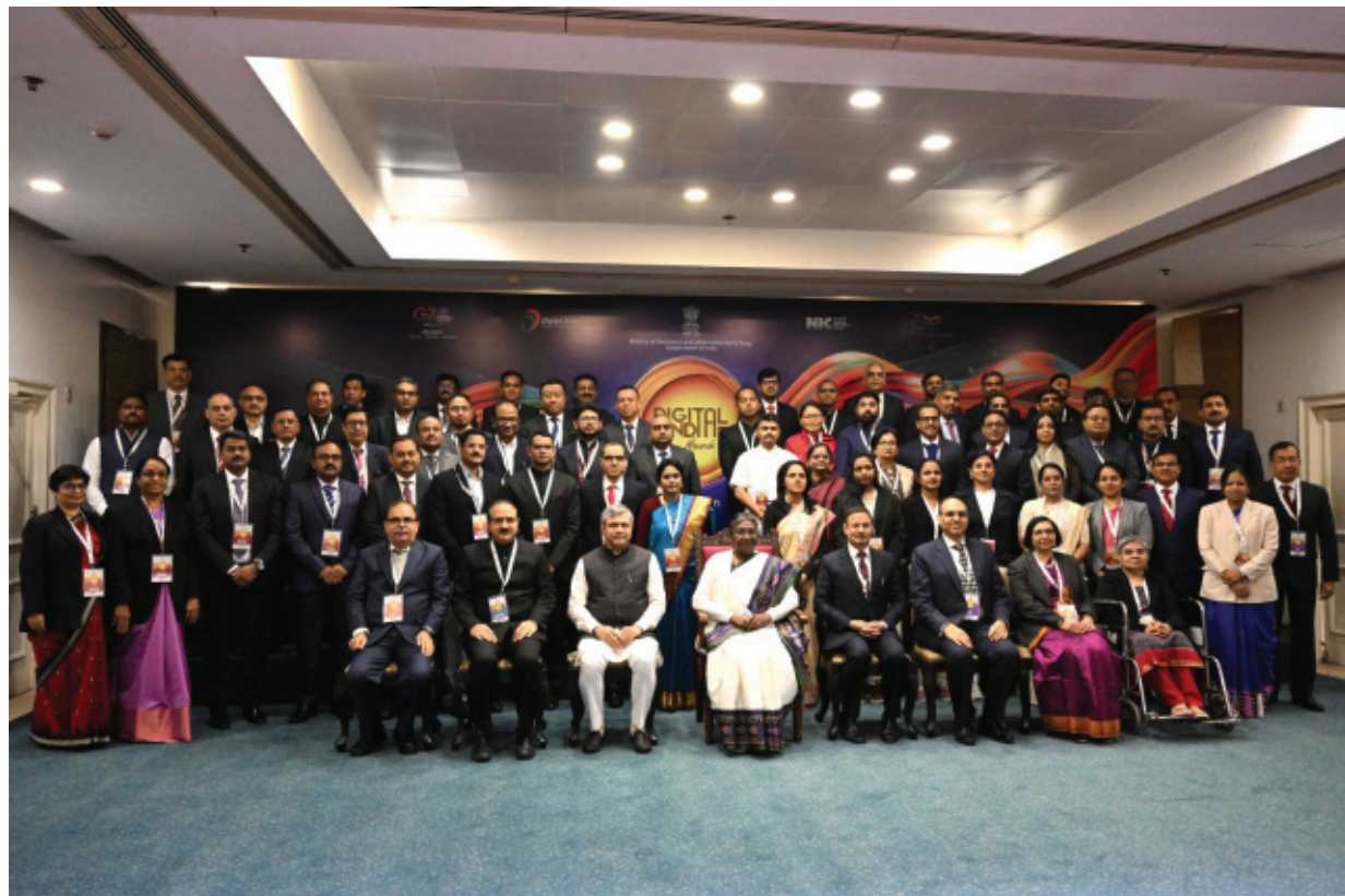
digital transformation is a story of innovation, implemen-

should strive to become a hub for software products. India should leverage prevailing policies and enable the ecosystem to position the country as a global powerhouse for software and hardware products by building innovative Made-in-India technologies. The President said that data is the cornerstone of creating new knowledge, insights and thus solutions; and leads to whole new fields of application. India should focus on democratising the use of government data so that young technology enthusiasts can use it to build localised digital solution