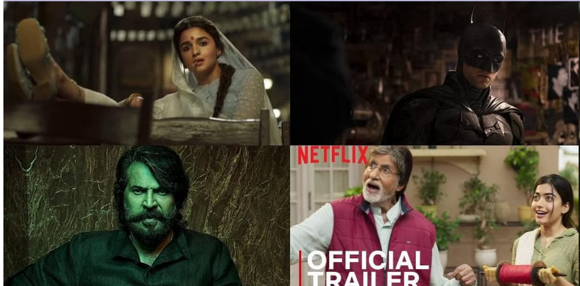
Another year filled with both great and not-so-great films. It was tricky to pick just 10 but we managed to narrow it down. From the Tamil blockbuster 'Vikram' to Amitabh-Rashmika's tear-jerker 'Goodbye', here are some of our favourites.