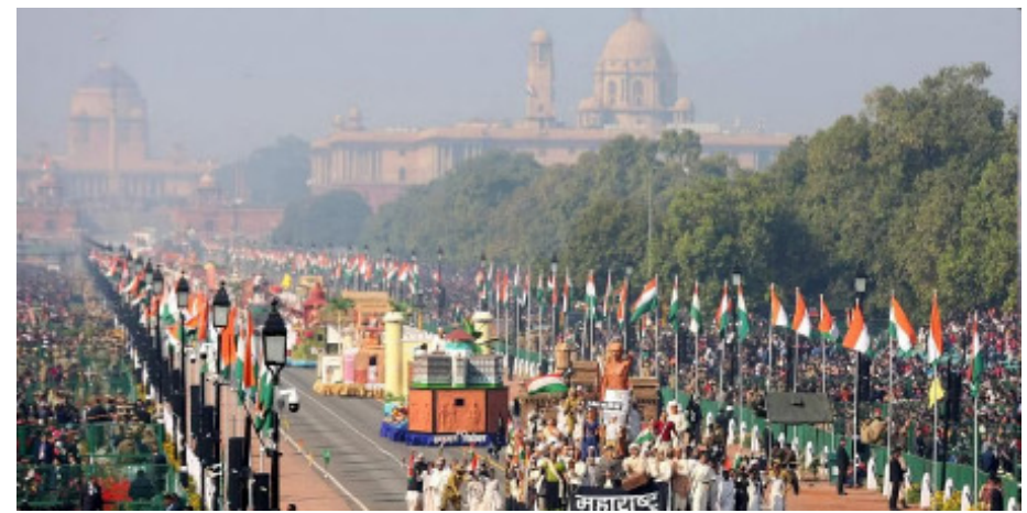
tableau as 'Deepotsav' has been chosen as the theme to represent the state in for the Republic Day parade in New Delhi on January 26, this year.

Ayodhya Deepotsav 2022 had set a new Guinness World Record for lighting over 15 lakh-earthen lamps on the banks of river Saryu as Prime Minister Narendra Modi participated in the celebrations on the Diwali eve.