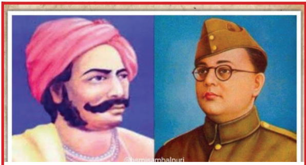
Respectful homage to Legendary freedom fighters Veer Surendra Sai & Netaji Subash Chandra Bose on their Birth anniversary.