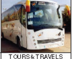
TOURS & TRAVELS

Required Single / Double / Triple Storied North/East facing building at Puri . Contact 9437 143 483