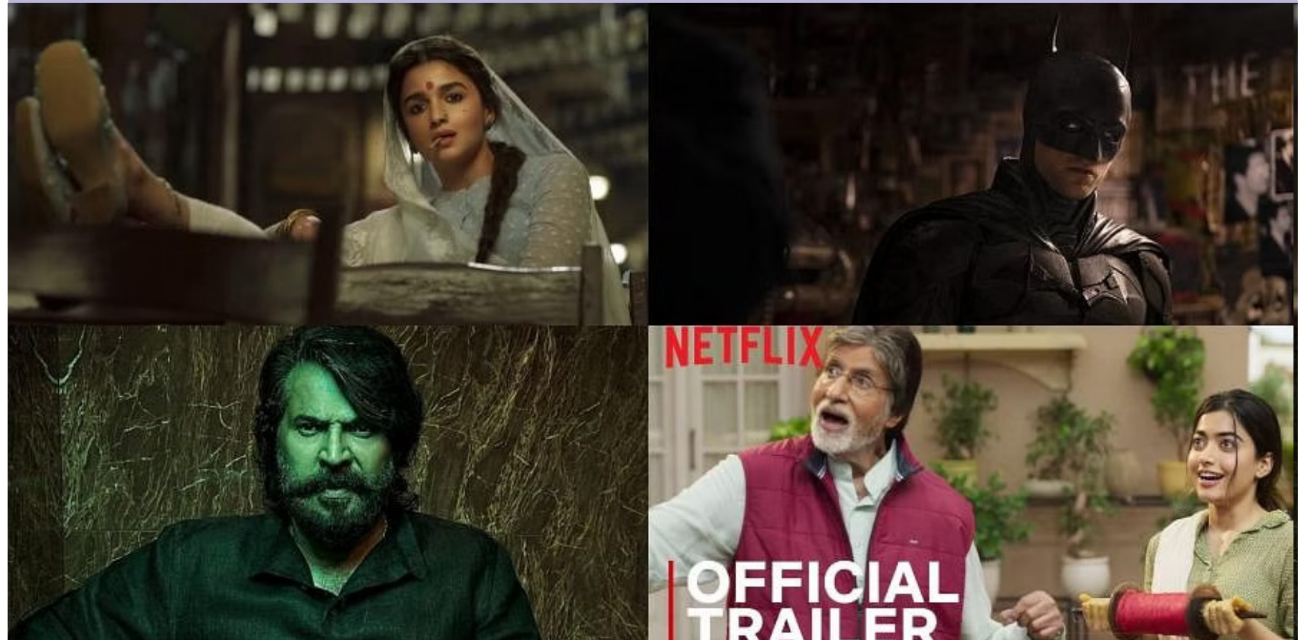
Another year filled with both great and not-so-great films. It was tricky to pick just 10 but we managed to narrow it down. From the Tamil blockbuster 'Vikram' to Amitabh-Rashmika's tear-jerker 'Goodbye', here are some of our favourites.