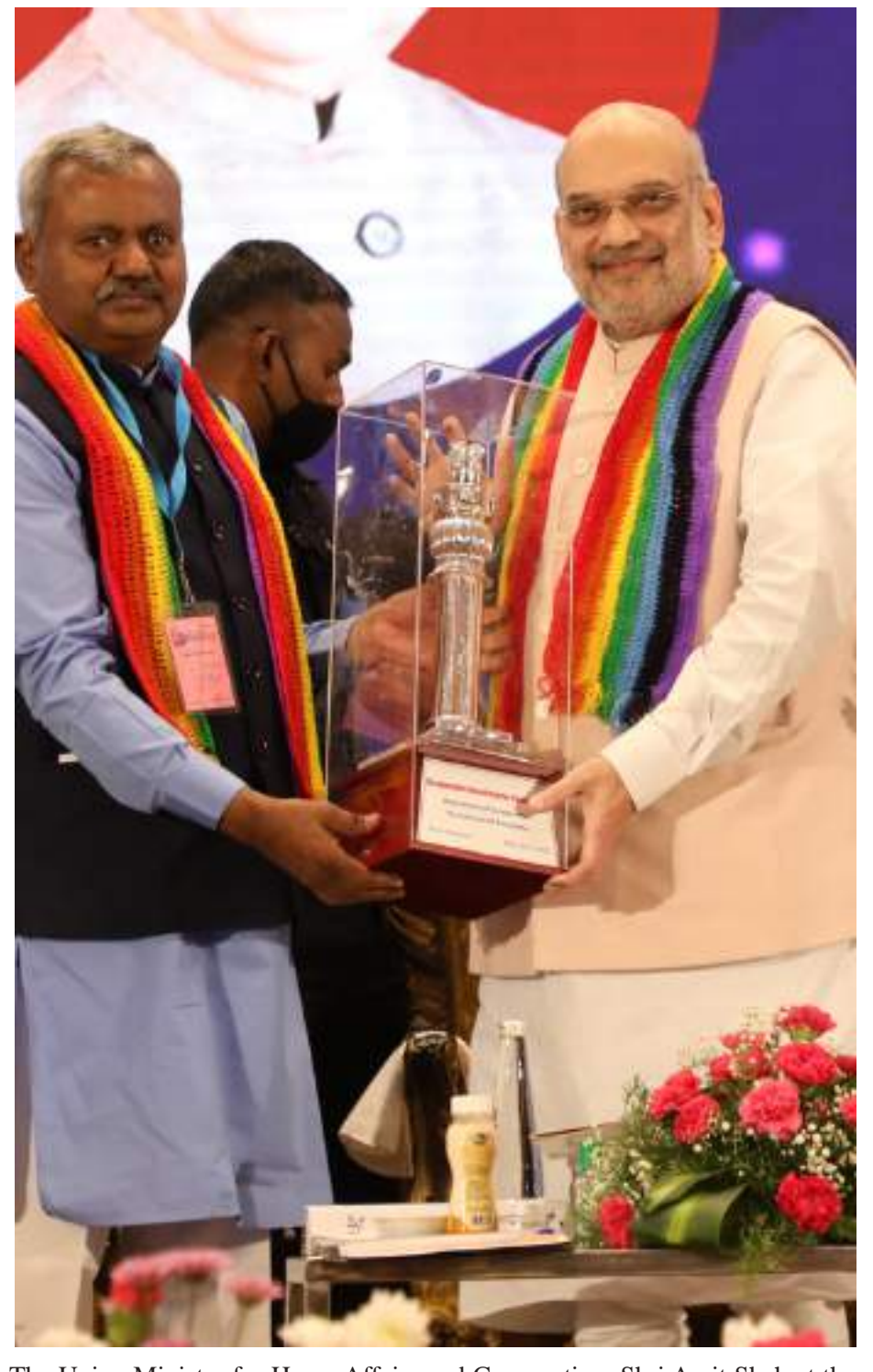
The Union Minister for Home Affairs and Cooperation, Shri Amit Shah at the 'Sahakar Labharthi Sammelan', in Bengaluru,