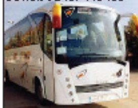
TOURS & TRAVELS

Required Single / Double / Triple Stored North/East facing building at Puri . Contact 9437143483