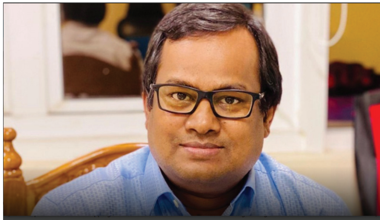
to groups, Mohalla classes etc., officials said

Teachers will be optimally engaged for 5-6 hours daily for teaching learning activities at school and beyond school premises.