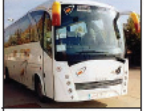
TOURS & TRAVELS

Required Single / Double / Triple Stored North/East facing building at Puri. Contact 9437143483