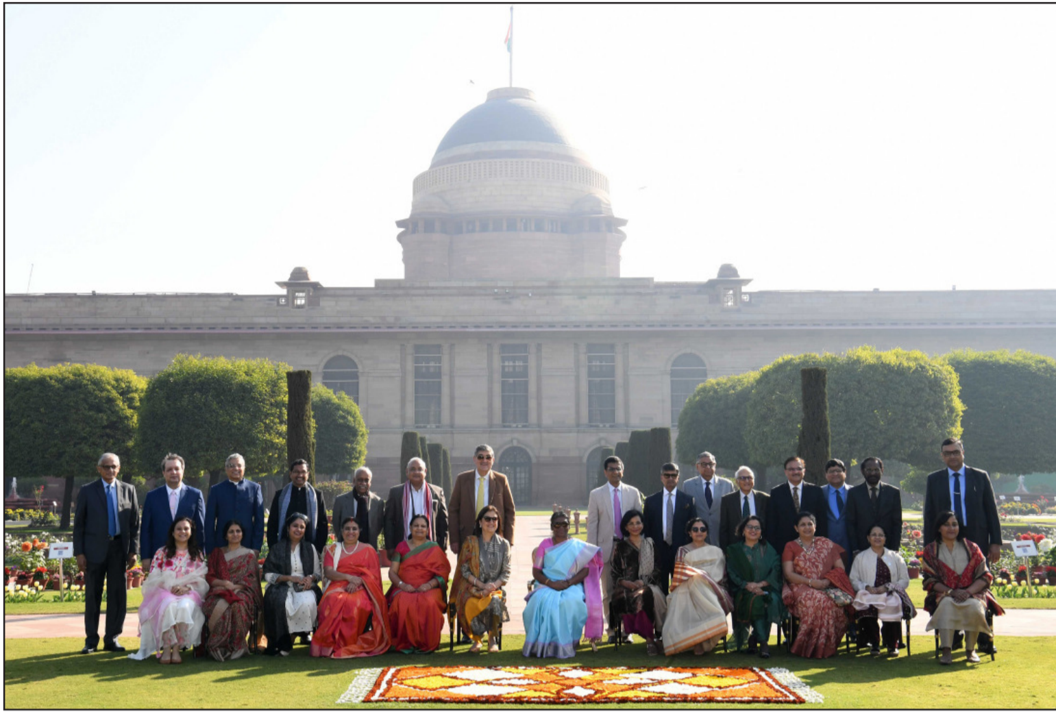
The President, Smt. Droupadi Murmu specially invites the Chief Justice of India, Dr Justice D.Y. Chandrachud and the judges of Supreme Court visits the Amrit Udyan, in Rashtrapati Bhavan, in New Delhi