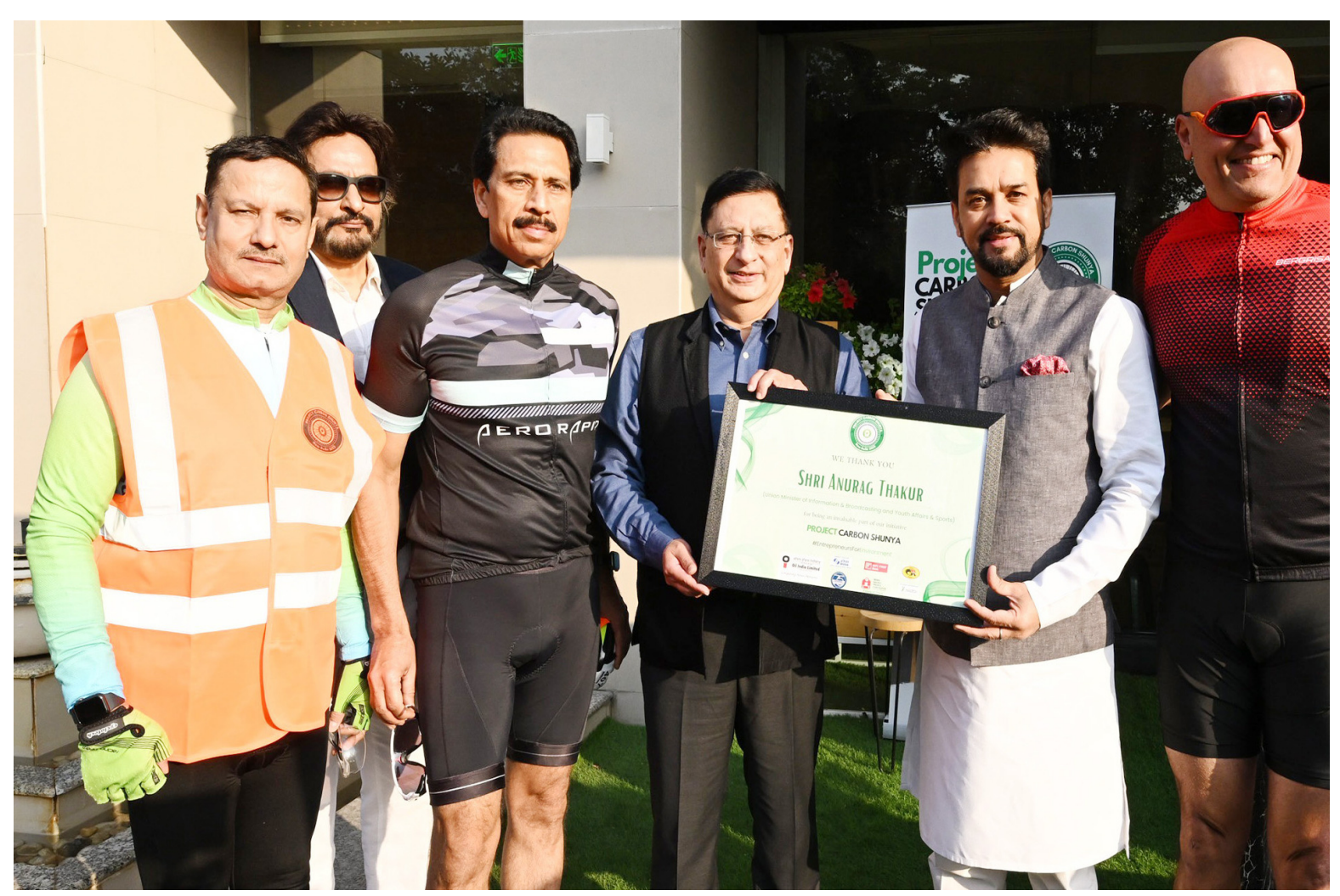
The Union Minister for Information & Broadcasting, Youth Affairs and Sports, Shri Anurag Singh Thakur attends the Project Carbon Shunya, in New Delhi