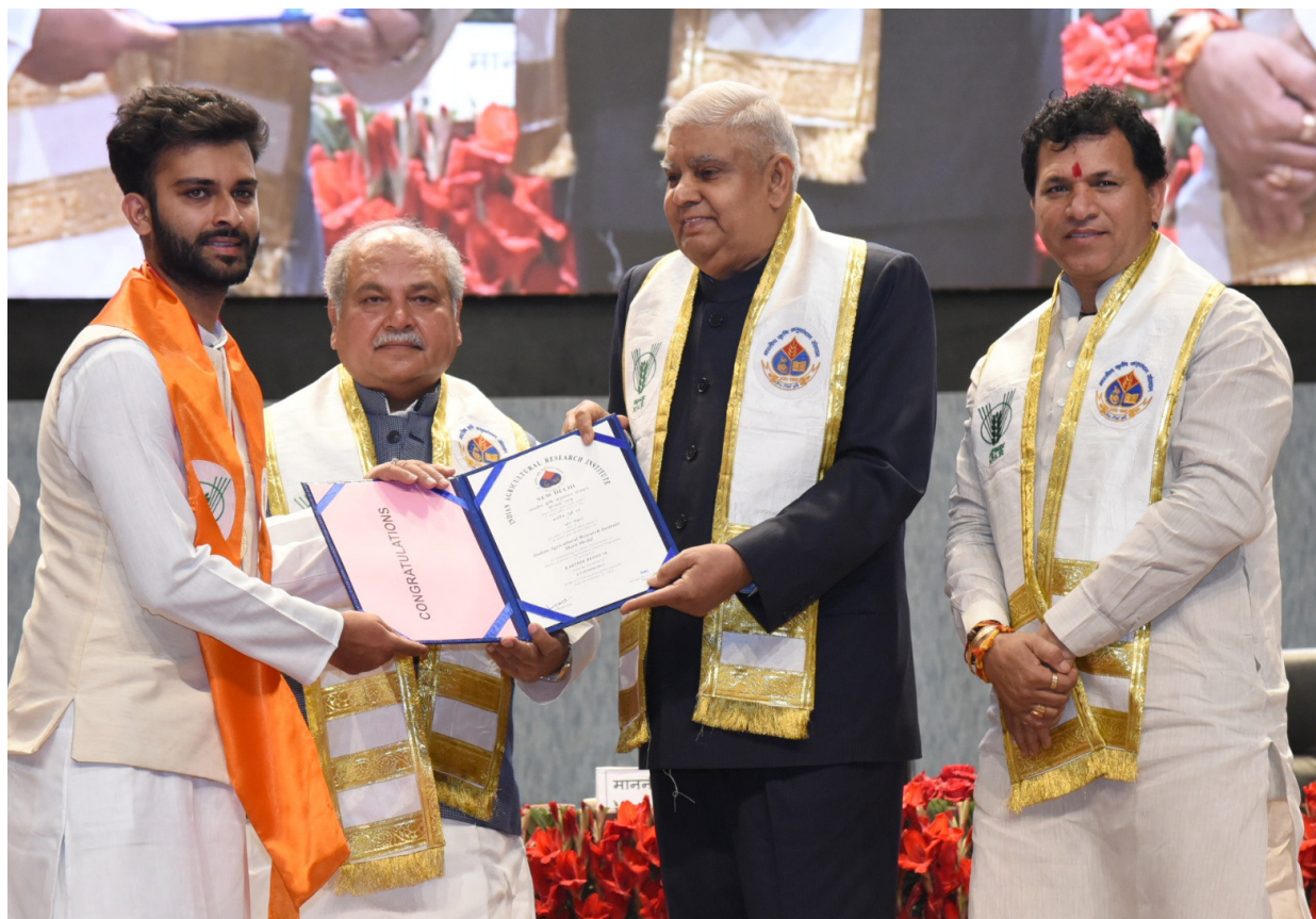
The Vice President, Shri Jagdeep Dhankhar felicitating the medals and awards to the meritorious students of MSc and PhD at the 61st convocation ceremony of ICAR-IARI, in New Delhi