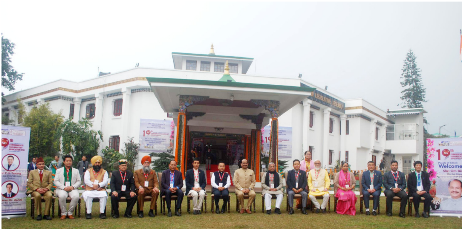
The Speaker, Lok Sabha, Shri Om Birla with the delegates at the inaugural session of 19th Annual Zone III Conference of Common Wealth Parliamentary Association (CPA), India Region at Sikkim Legislative Assembly at Gangtok, in Sikkim

a Delhi-Raipur flight in connection with alleged derogatory remarks against the prime minister. Mr Khera had recently called him "Narendra Gautamdas Modi", in an apparent swipe at the prime minister over the row involving business tycoon Gautam Adani. The prime minister's full name is Narendra Damodardas Modi, with the middle name standing for his father's name. The BJP accused the Congress spokesperson of insulting the prime minister.