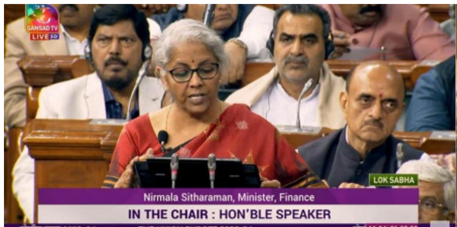
Nirmala Sitharaman, Minister, Finance IN THE CHAIR : HON'BLE SPEAKER

* Mobility Infra --- 50 CONTINUED ON: P-7