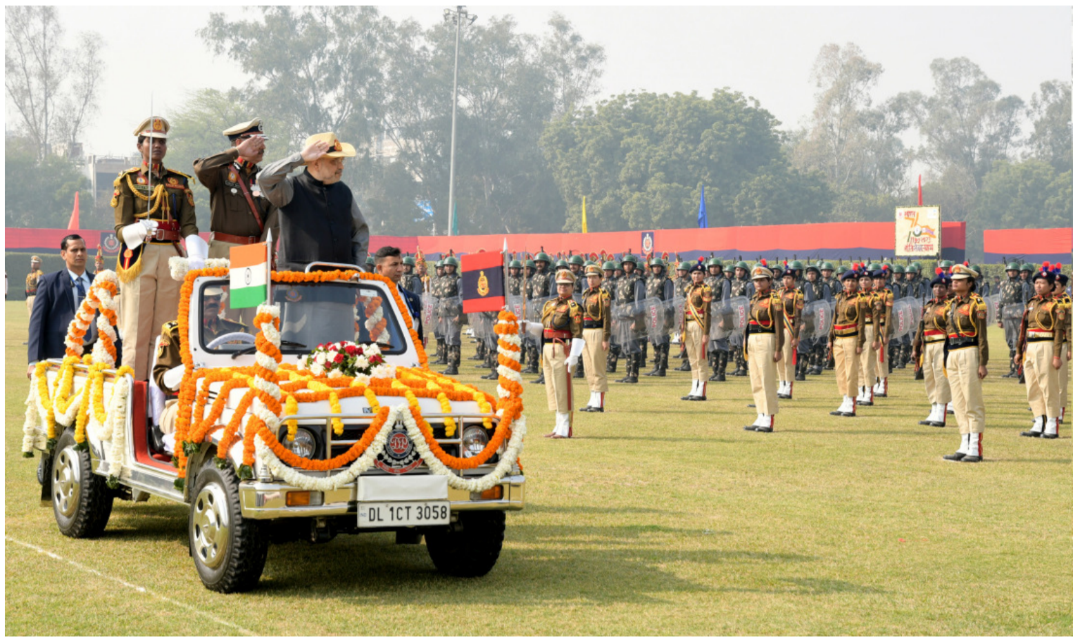
The Union Minister for Home Affairs and Cooperation, Shri Amit Shah attends the 76th Raising Day celebrations of Delhi Police as Chief Guest, in New Delhi