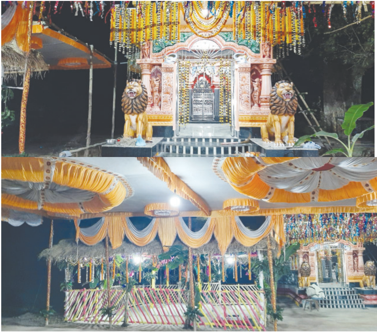
Maa Tarini Temple will be consecrated at Belasundari Village, Ramachandrapur, Keonjhar on 9th and 10 th february with all Rituals and rites....