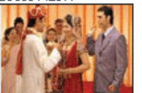
MATRIMONIAL BRIDE WANTED

Saving 10,000/- for high return, extra earn and foreign trip opportunity, 9238904001. Independent business work from home, training in Singapore, 9338014287.