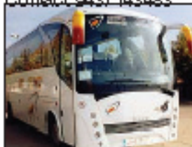
TOURS & TRAVELS

Required Single / Double / Triple Stored North/East facing building at Puri. Contact 9437143483