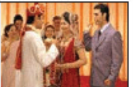
MATRIMONIAL BRIDE WANTED

Wanted bride for Khandayat Boy, 37plus, Caste no bar, 0674-2555763