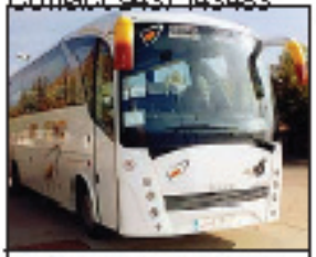
TOURS & TRAVELS

Required Single / Double / Triple Stored North/East facing building at Puri . Contact 9437 143483