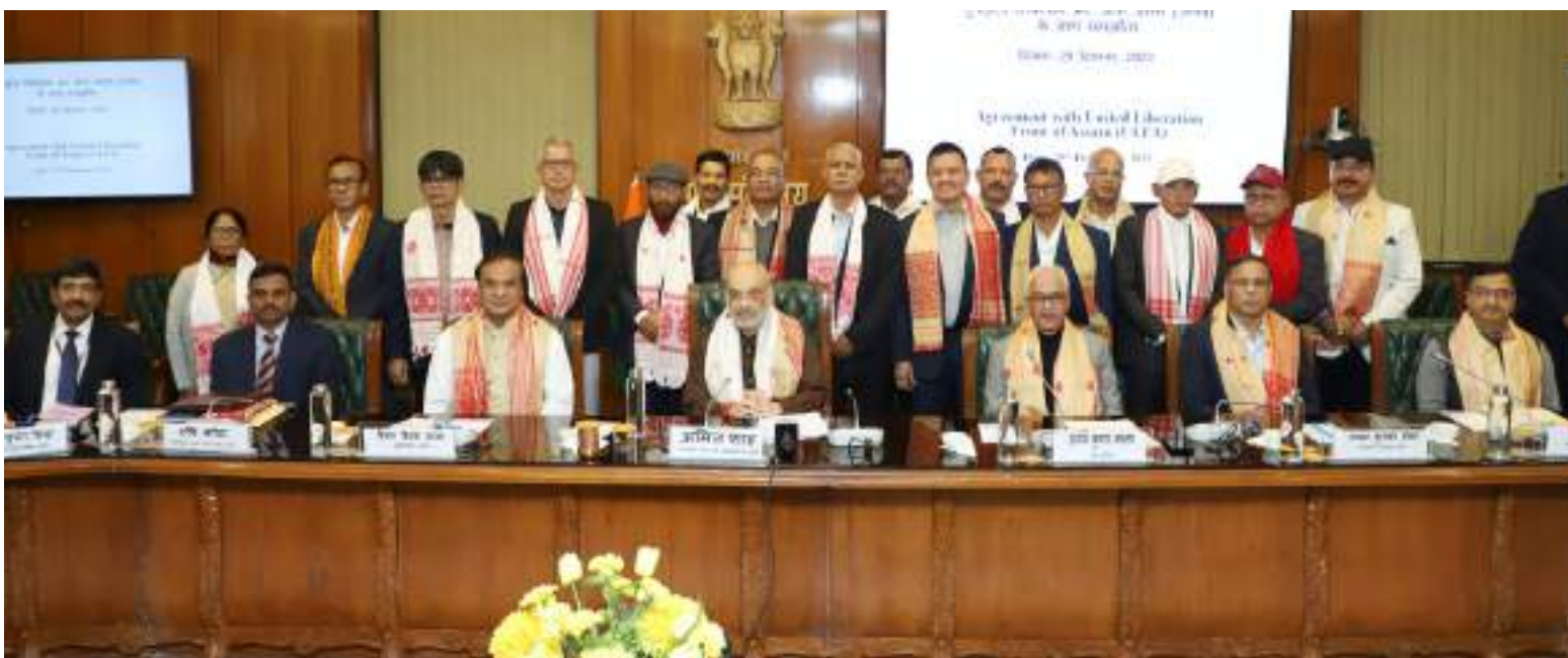
he Union Minister for Home Affairs and Cooperation, Shri Amit Shah at the signing of a memorandum of settlement with ULFA, in New Delhi