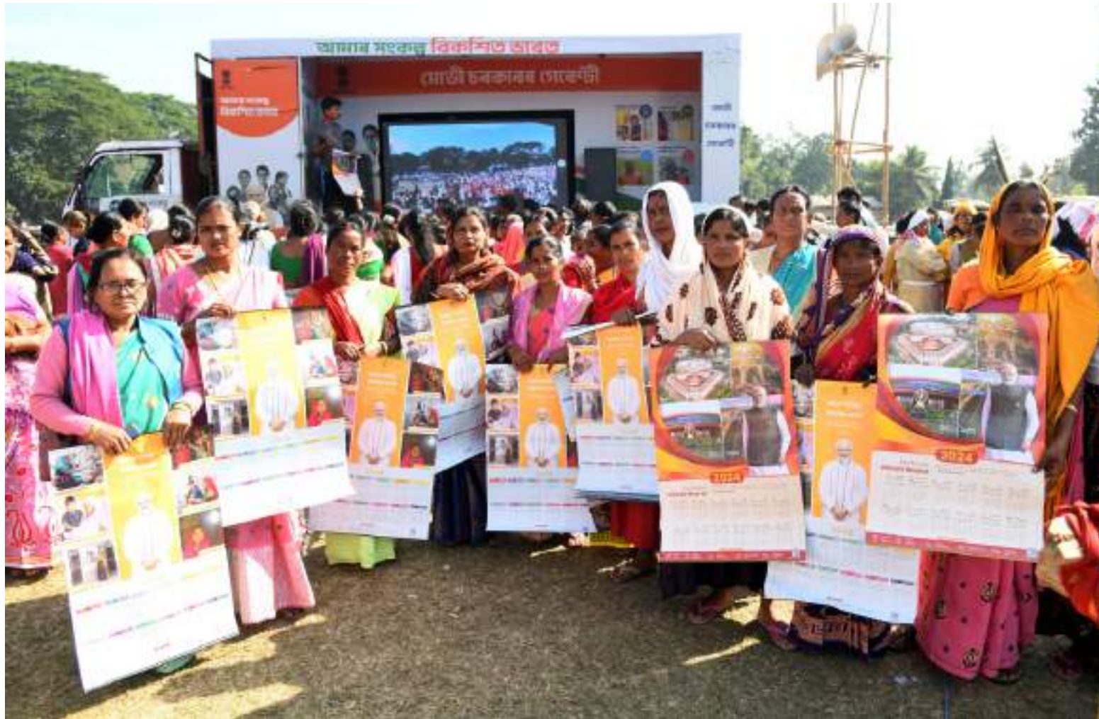
Glimpses of Viksit Bharat Sankalp Yatra at Mirza, Kamrup, in Assam

between the parties has pinnacle to complete loss of faith, trust, understanding, love and affection between the parties. This dead relationship has become infested with acrimony, irreconcilable differences and protracted litigations; any insistence to continue this relationship would only be perpetuating further cruelty upon both the parties," the bench said. It said the bedrock of any matrimonial relationship is cohabitation and conjugal relationship. The couple got married in April 2009 and had a daughter in October 2011. The woman left her matrimonial home a few days before she delivered the child.