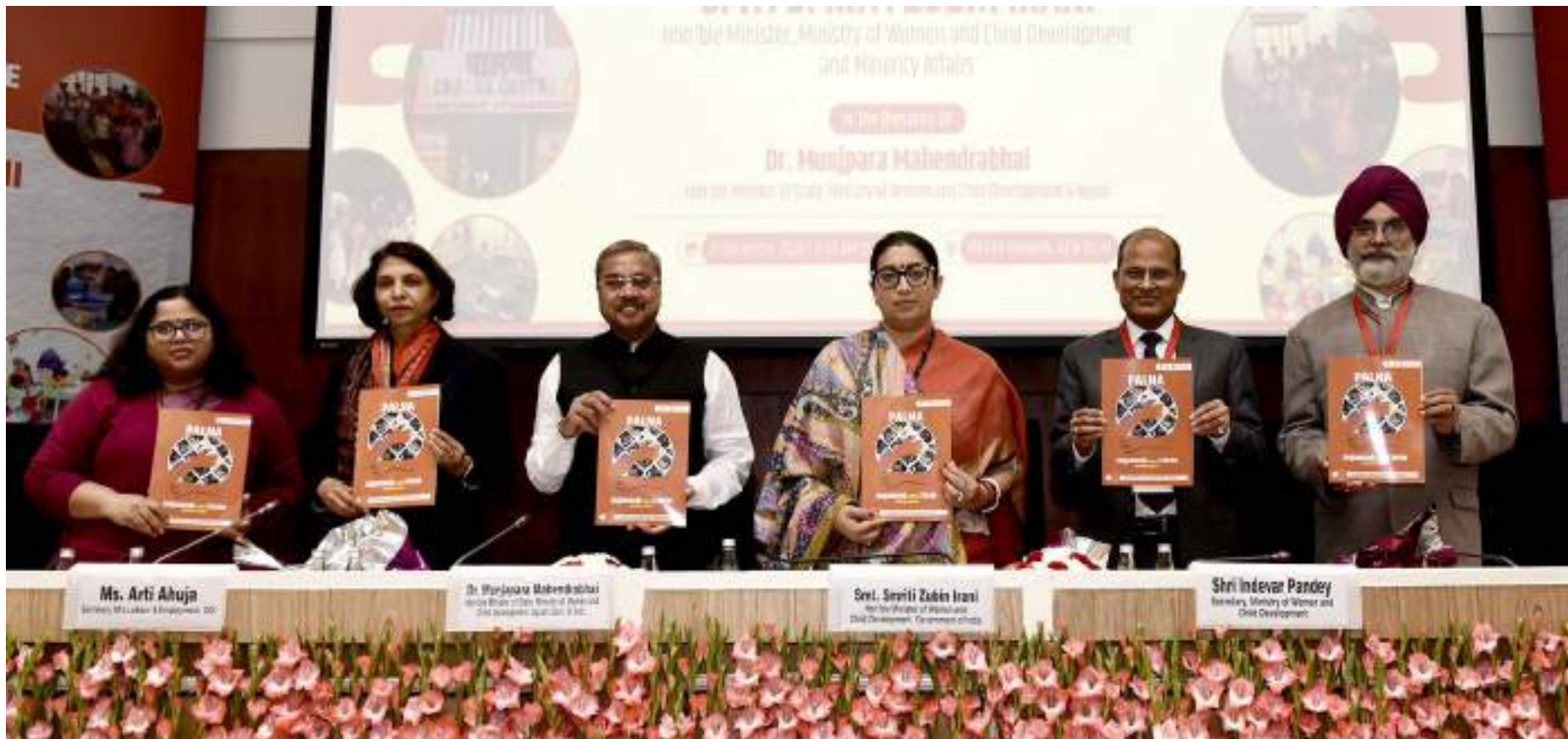
The Union Minister for Women & Child Development and Minority Affairs, Smt. Smriti Irani and the Minister of State for Women and Child Development and AYUSH, Dr. Munjapara Mahendrabhai attend "National Programme on Aanganwadi – cum - Crèches (Mission Shakti)", in New Delhi