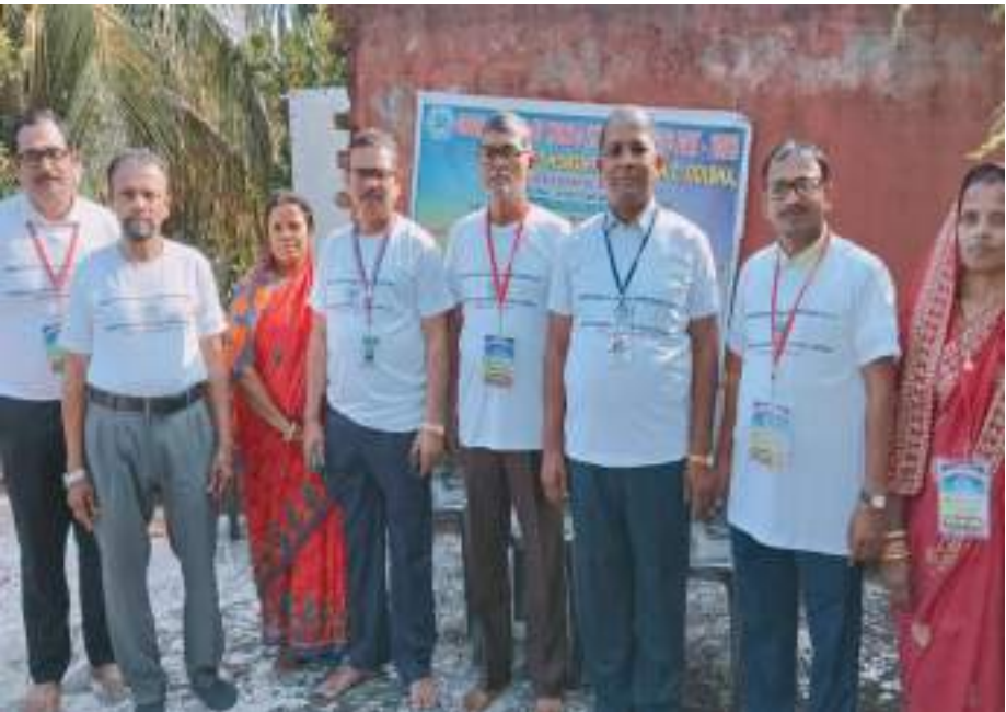
Celebration of World Human Rights Day by Balasore Unit of CITIZEN'S HUMAN RIGHTS CLINIC, ODISHA

geographically and economically accessible to many more Indians. It is worth mentioning here that JioPhone Next, designed jointly by Jio and Google, is the world’s most affordable 4G smartphone that comes with a 5.45” HD screen with Corning Gorilla Glass 3 and anti-fingerprint coating, 2GB RAM, 32 GB in-built storage (expandable up to 512GB), 13MP back camera, 8MP front selfie camera, 3500 mAh battery, and a range of other advanced features which include voice fast capabilities, read aloud, translate now, easy and smart camera, automatic feature update, easy media share, OTG support etc.