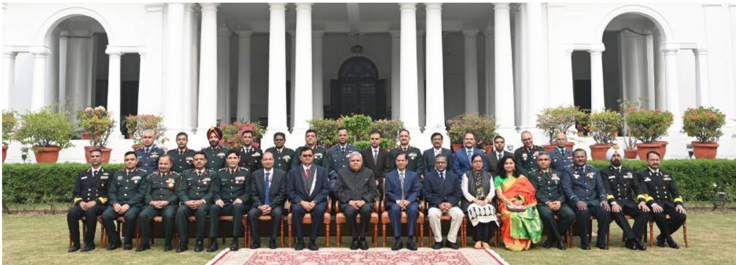
The Vice President and Chairman, Rajya Sabha, Shri Jagdeep Dhankhar in a group photograph with the participants of the 49th Advanced Professional Programme in Public Administration (APPPA) at Upa-Rashtrapati Nivas, in New Delhi