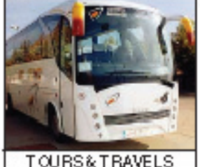
TOURS & TRAVELS

Required Single / Double / Triple Stored North/East facing building at Puri. Contact 9437143483