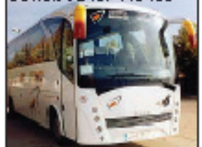
TOURS & TRAVELS

Required Single / Double / Triple Stored North/East facing building at Puri. Contact 9437143483