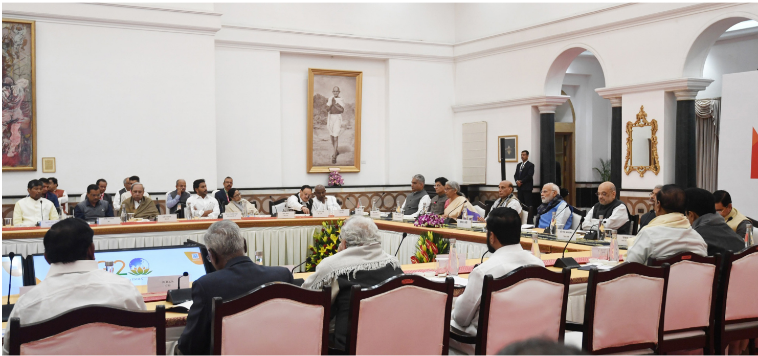
PM attends G20 All Party Meeting, in New Delhi