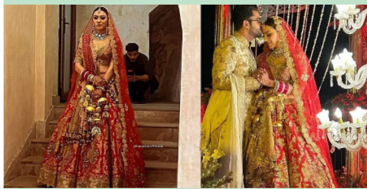
JAIPUR(KCN): Actress Hansika Motwani