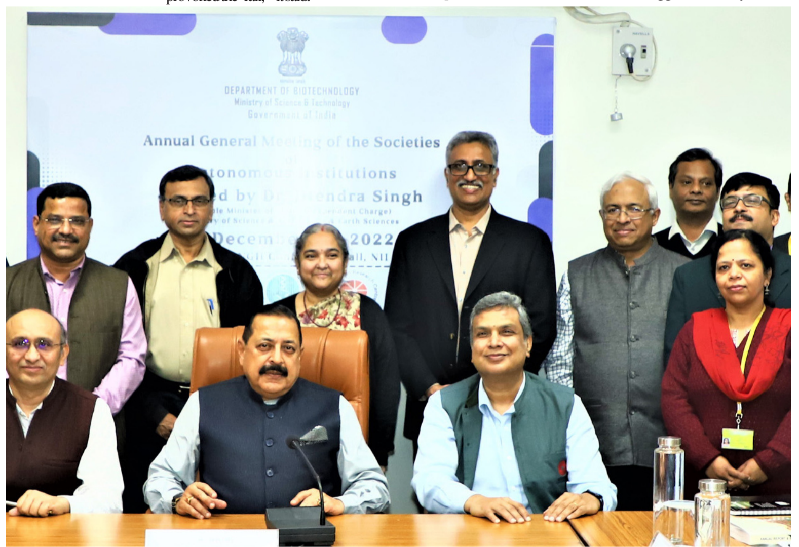
The Minister of State for Science & Technology and Earth Sciences (I/C), Prime Minister's Office, Personnel, Public Grievances & Pensions, Atomic Energy and Space, Dr. Jitendra Singh in group photograph with Directors of different leading frontier Biotechnology Institutes of India at an extended comprehensive review meeting at National Institute of Immunology, in New Delhi

The Oath Keepers is a right-wing organisation formed in 2009 by army veteran Stuart Rhodes, shortly after the election of Barack Obama.