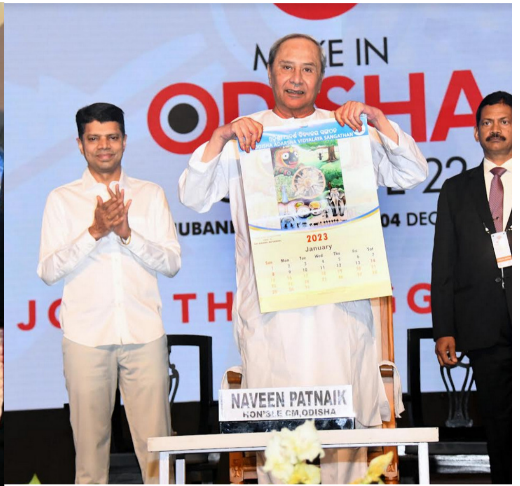
Chief Minister Shri Naveen Patnaik at the Transformation of School Education Session of Make in Odisha Conclave-2022 at Janata Maidan