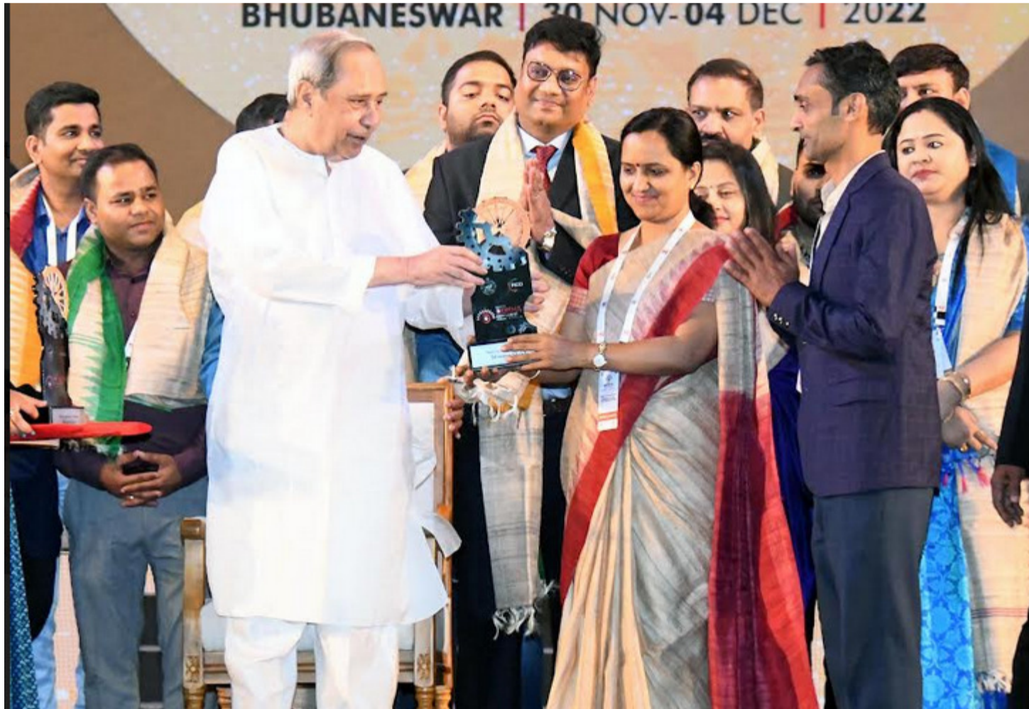
Chief Minister Shri Naveen Patnaik at the Valedictory Session of Make in Odisha Conclave-2022 at Janata Maidan