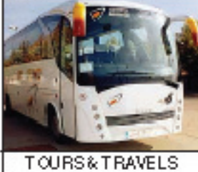
TOURS & TRAVELS

Required Single / Double / Triple Storied North/East facing building at Puri . Contact 9437 143 483