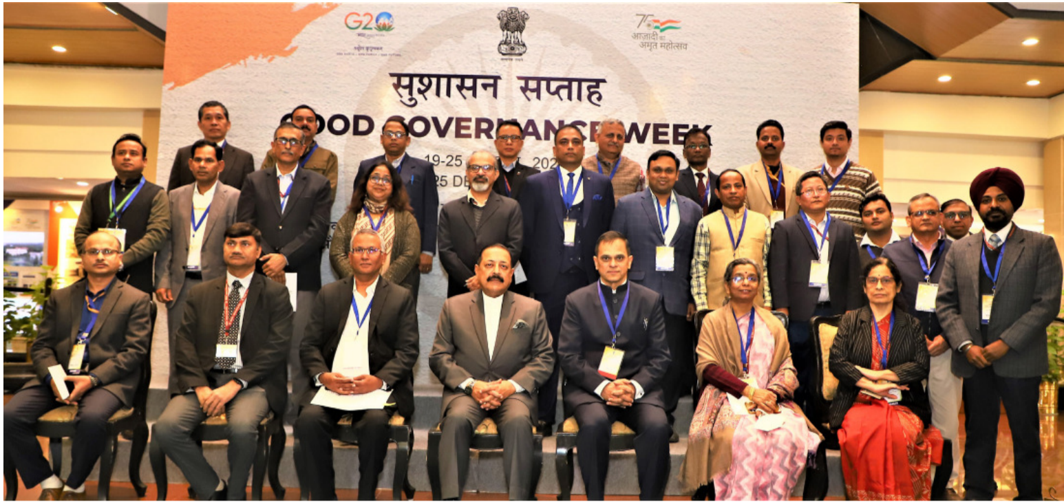
The Minister of State for Science & Technology and Earth Sciences (I/C), Prime Minister's Office, Personnel, Public Grievances & Pensions, Atomic Energy and Space, Dr. Jitendra Singh at the inauguration of "Good Governance Week", in New Delhi