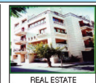
SALE ready possession before Rathayatra at Puri near Seabeach for sale. Contact :986:1078308

Required a Marshal/ Commandor/Bokenoin good condition, Contact 2555763