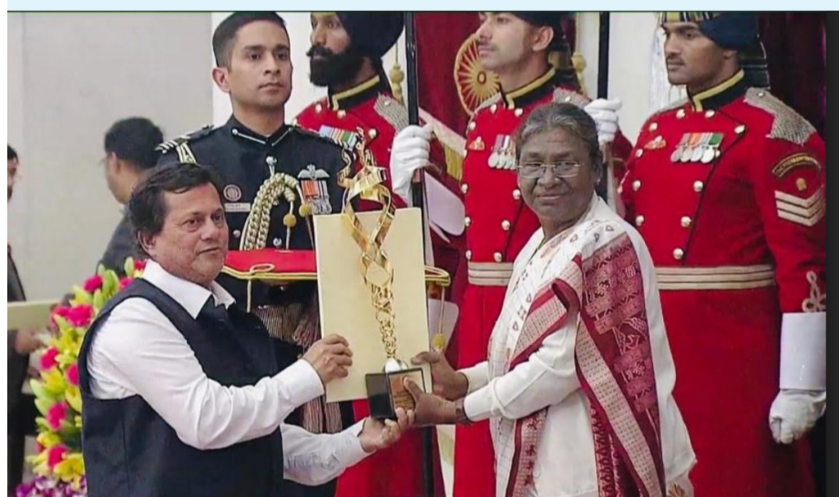
The award was received by Founder of KIIT & KISS Dr Achyuta Samanta from Hon'ble President Droupadi Murmu

Bhubaneswar(KCN): President and Govt of Kalinga Institute of Industrial Technology (KIIT) on Wednesday was conferred the Rashtriya Khel Protsahan Puruskar 2022. The award was given away by President Droupadi Murmu to the Founder of KIIT and KISS Dr Achyuta Samanta.