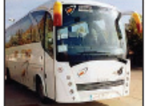
TOURS & TRAVELS

Required Single / Double / Triple Stored North/East facing building at Puri. Contact 9437143483