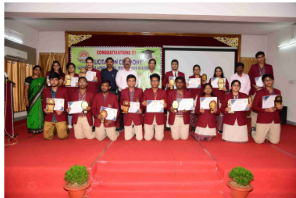
Kalinga Nagar felicitated its high achievers