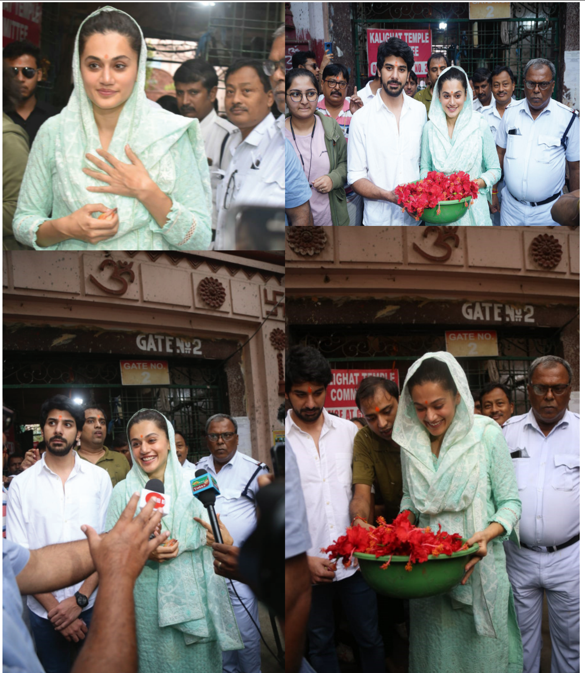
On the occasion of Release Day of the film DOBAARAA, Taapsee Pannu and Pavail Gulati visited Kalighat Temple to seek blessings of the Goddess for their movie. Neeraj Bharadwaj is shooting for web series 'Saazish' in Bhopal